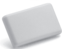
F145-1328 Indoor Remote Sensor