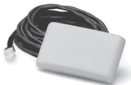
F145-1378 Outdoor Remote Sensor